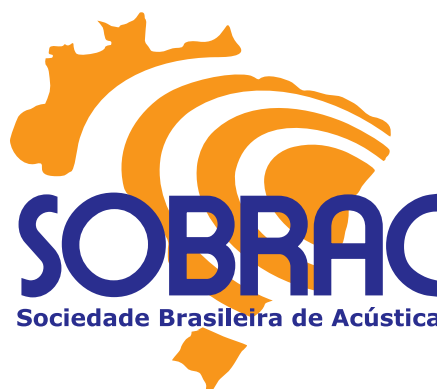
Figure 1: Official logo of the Brazilian Acoustics Society – Sobrac.