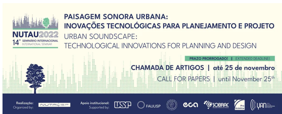
Figure 1: Call for the 14th International Seminar NUTAU 2022.